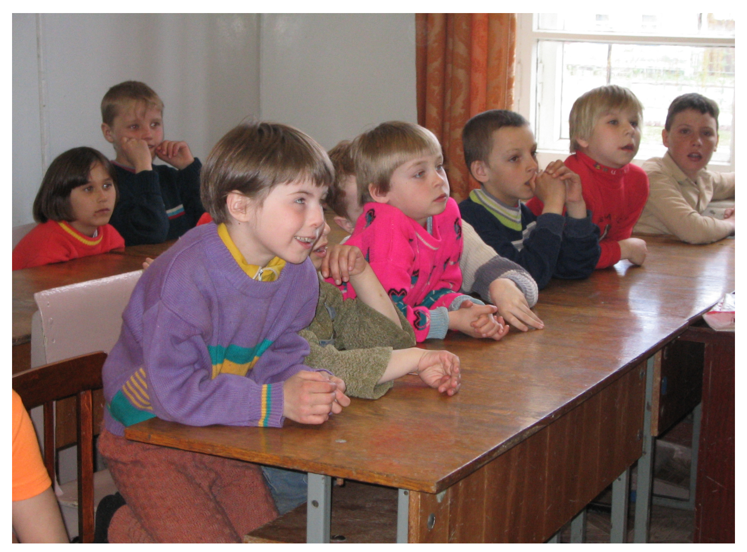
Compiled by Rachel Miller Forbid Them Not Independent Baptist Ministries, 2010

SCRIPTURE AND THE FATHERLESS SCRIPTURE AND THE FATHERLESS